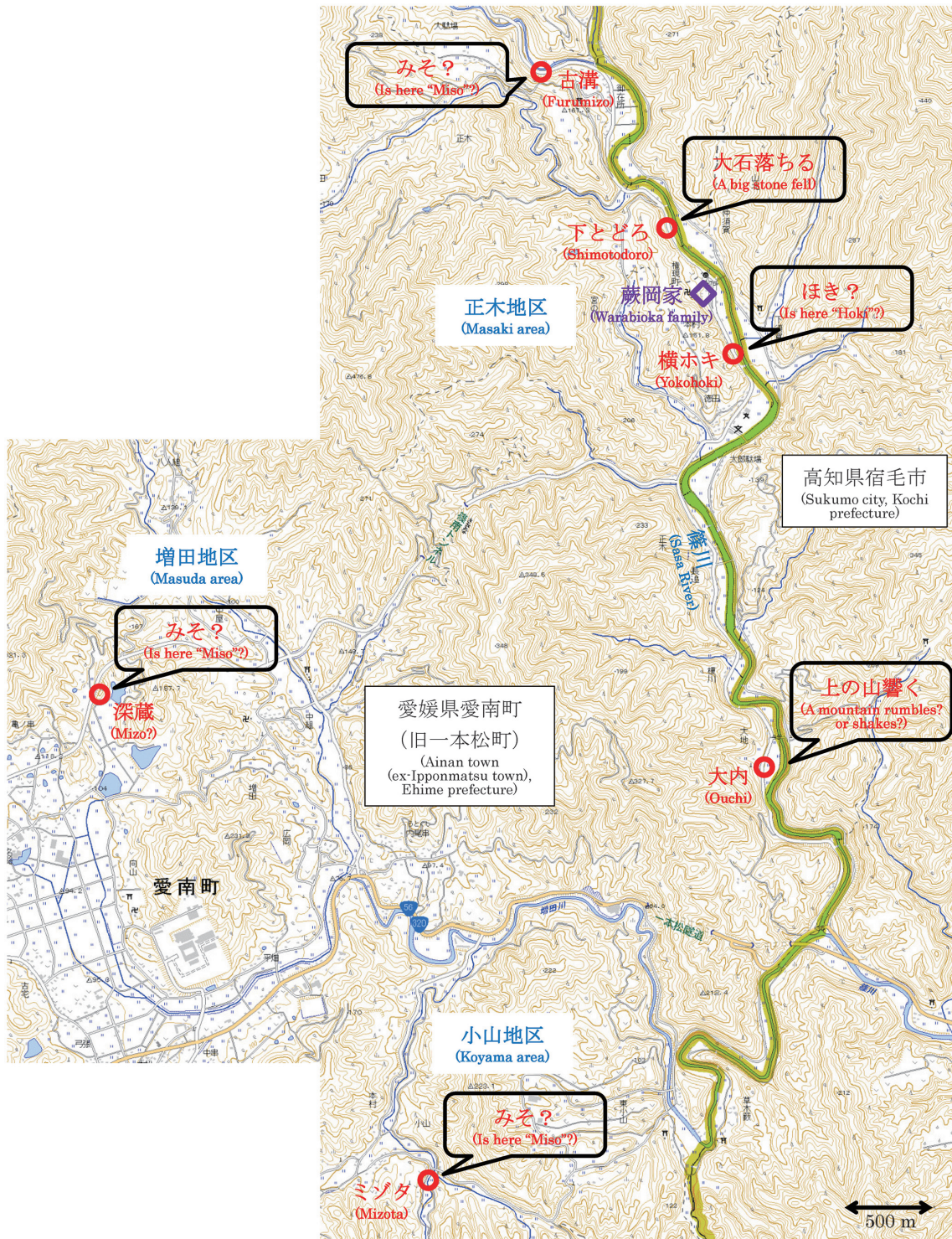
Fig. 6. Map showing the location of rock fall and the places where people heard a sound of earth tremors from high mountain in Masaki region after the 1854 Ansei Nankai earthquake.